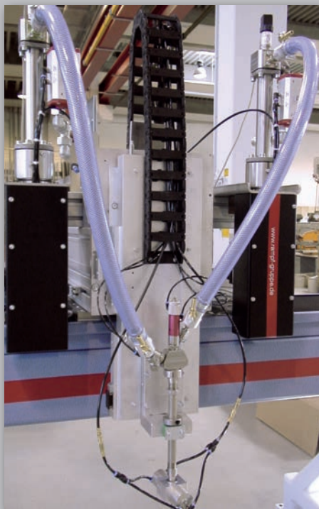
E-KDP 250 with static mixer

The optimal adjustment to the process conditions is completed by the servo-electric transmission principle.