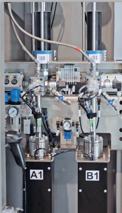
E-KDP 63 with cartridges