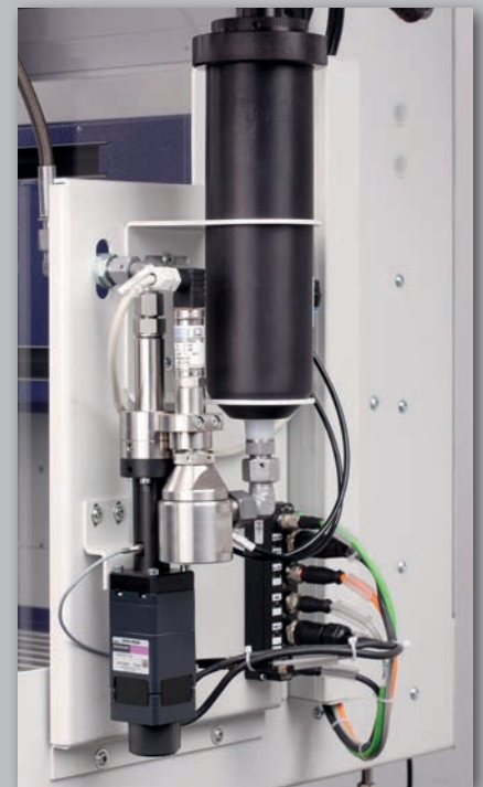
E-KDP 3 with cartridge