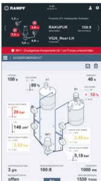
Monitoring of dispensing process