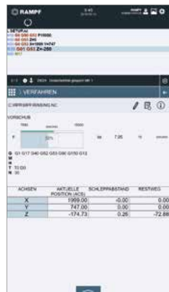
NC axis movements