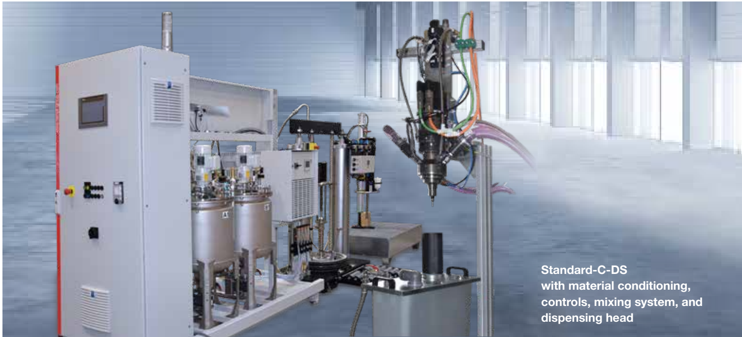
Standard-C-DS with material conditioning, controls, mixing system, and dispensing head